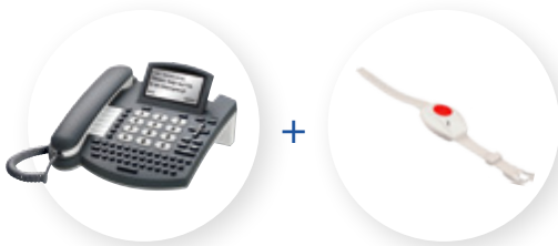
GSM desktop phone