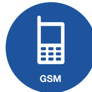
SMS and phone calls