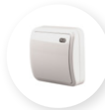
Emergency wall button