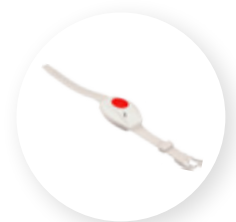
Personal help button